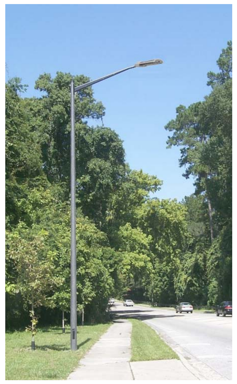
Light Types L42, L43 and L44