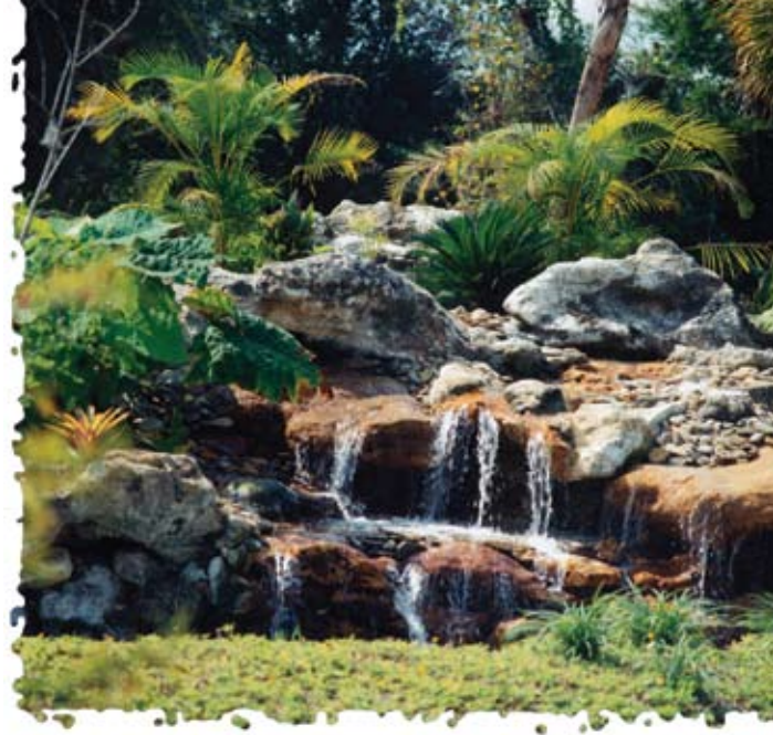
Kanapaha Botanical Gardens demonstrate the safety and beauty of reclaimed water, which has allowed the gardens to flourish.

On the cover: Wetland plants will be used to filter reclaimed water before it is used to restore natural wetlands within Paynes Prairie Preserve State Park.