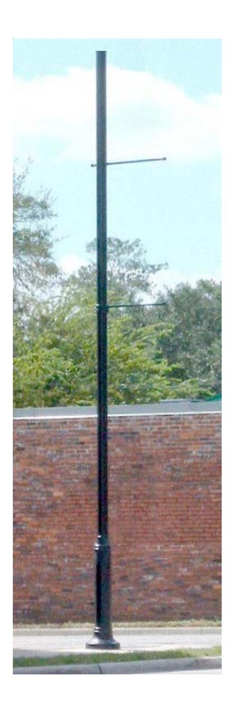
Pole Type P5