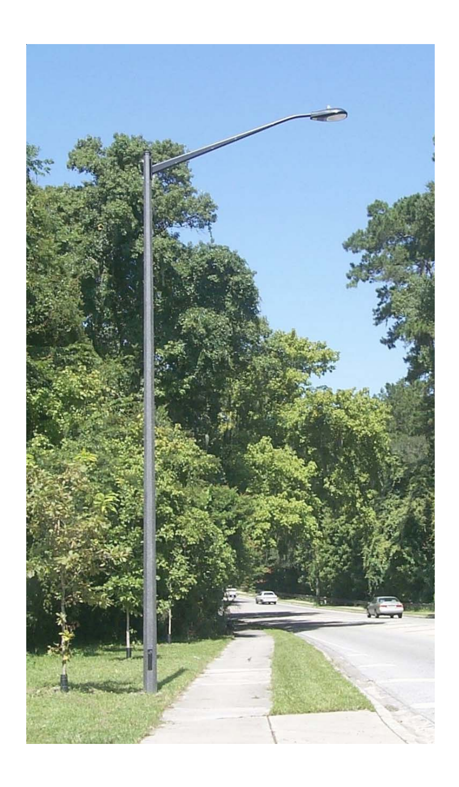
Light Types L24, L31 and L32