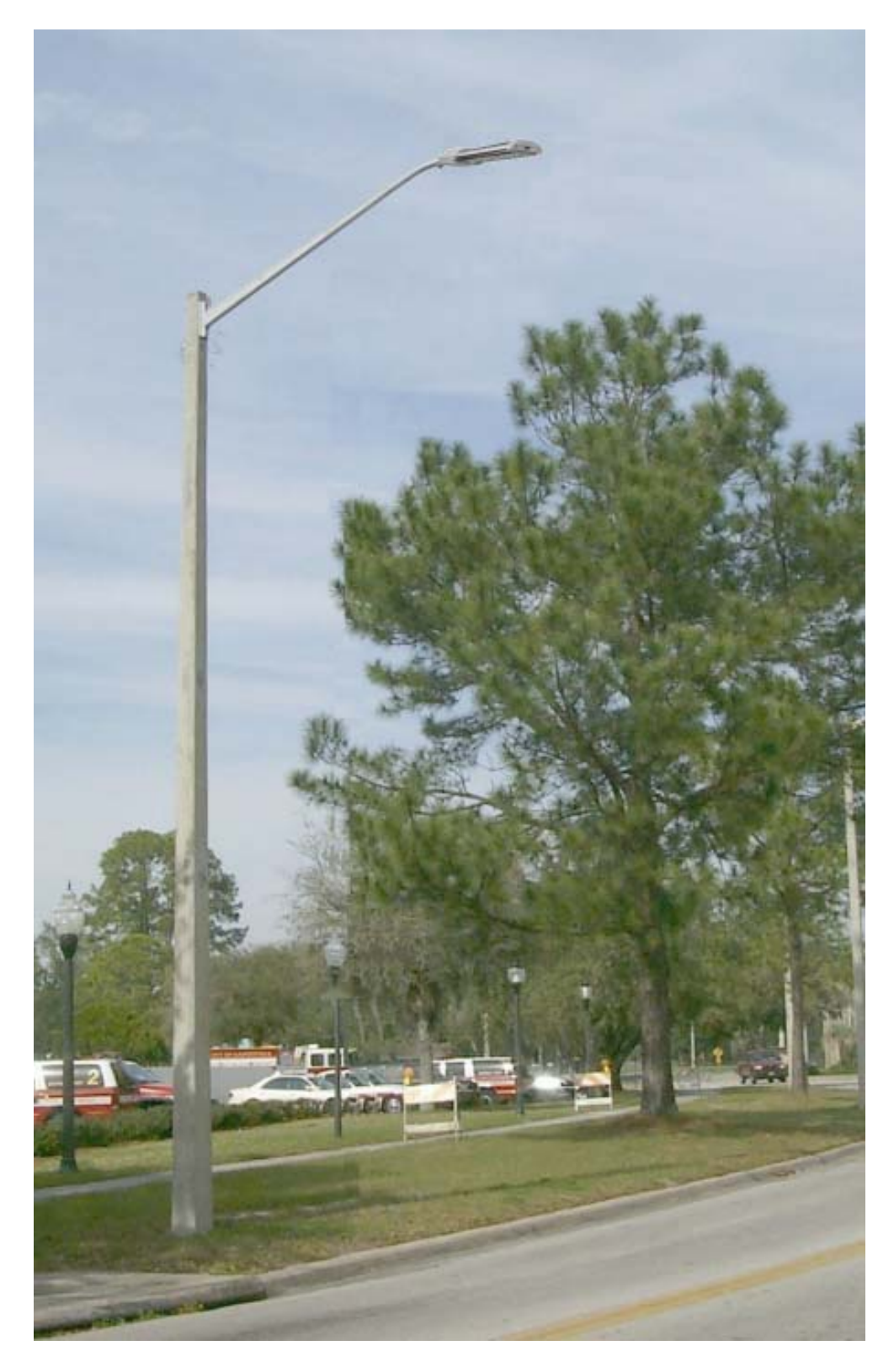
Light Types L38, L39, L40 and L41