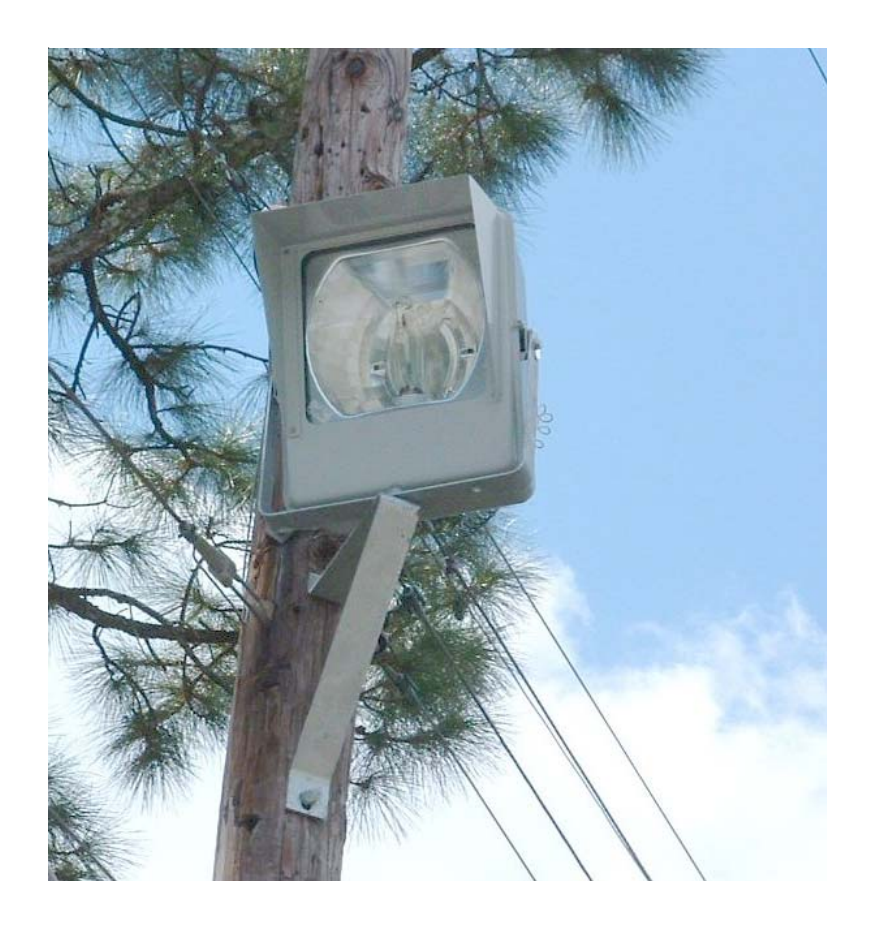
Light Types L10, L12, and L22