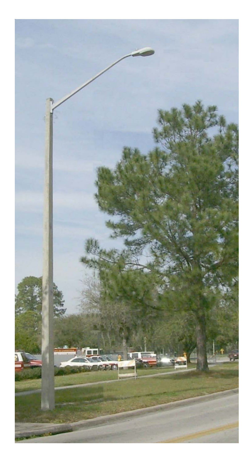
Light Types L11, L14, L16 and L23