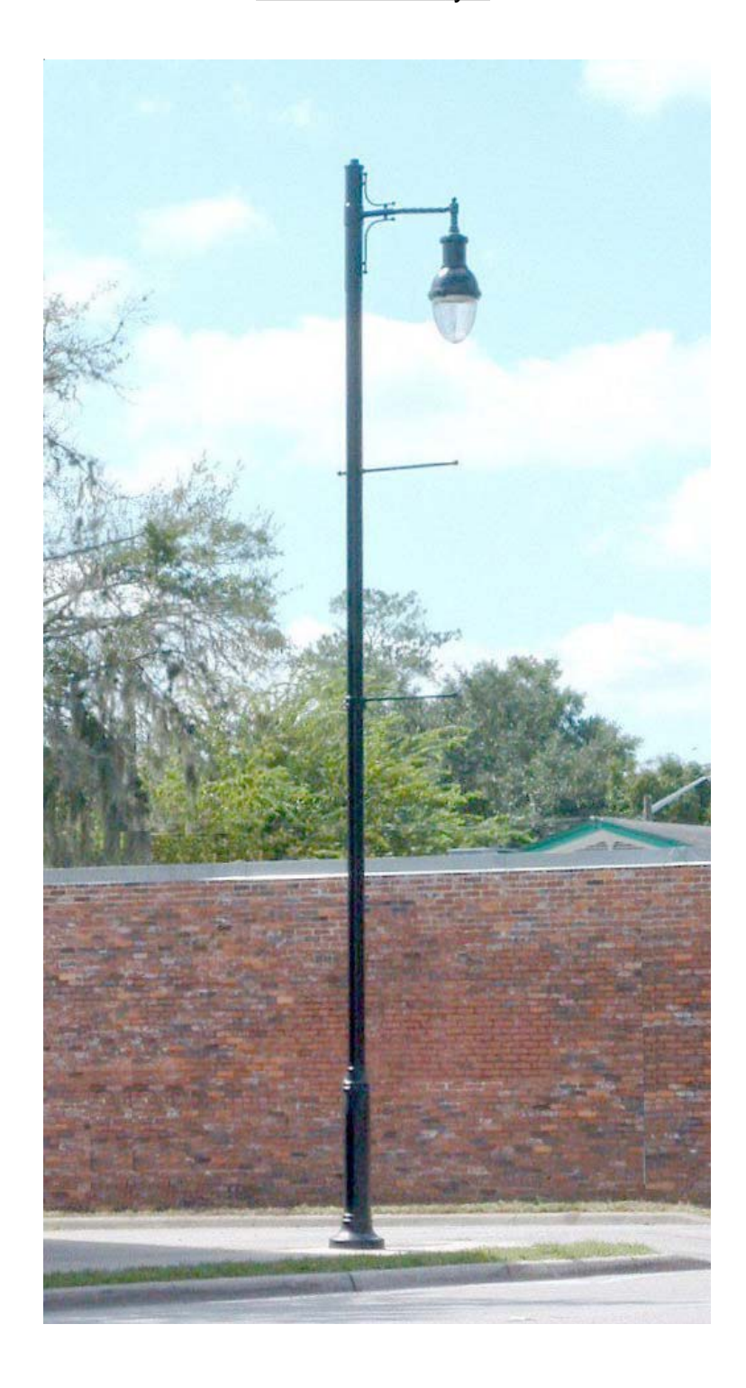
Light Types L33 and L34