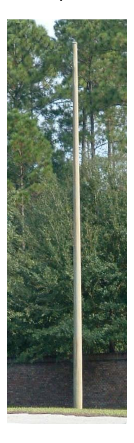
Pole Type P10