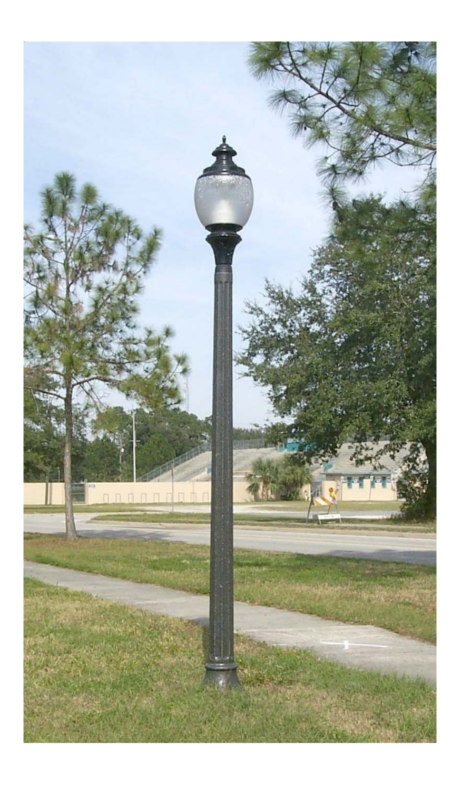
Light Types L35A and L36