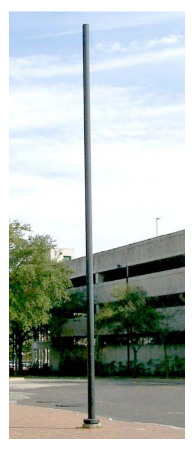
Pole Type P11