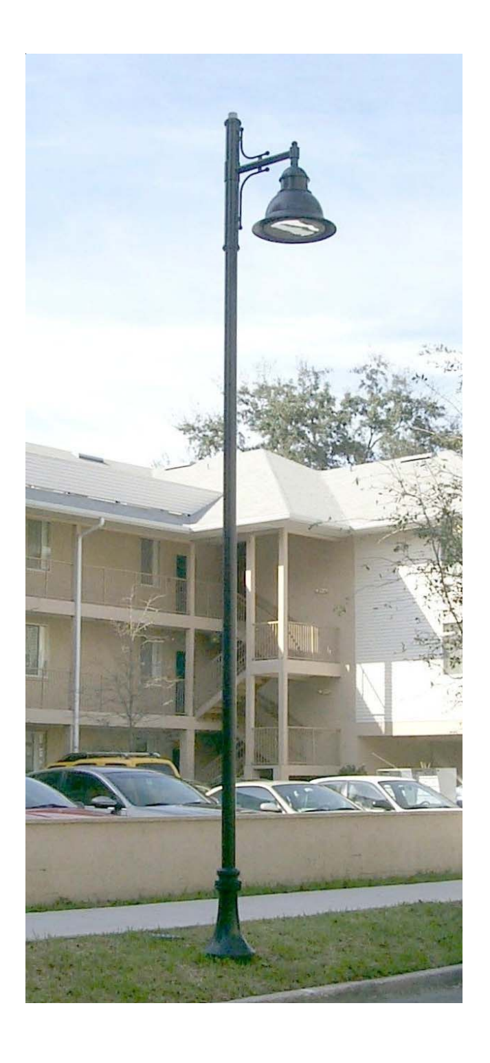
Light Type L27