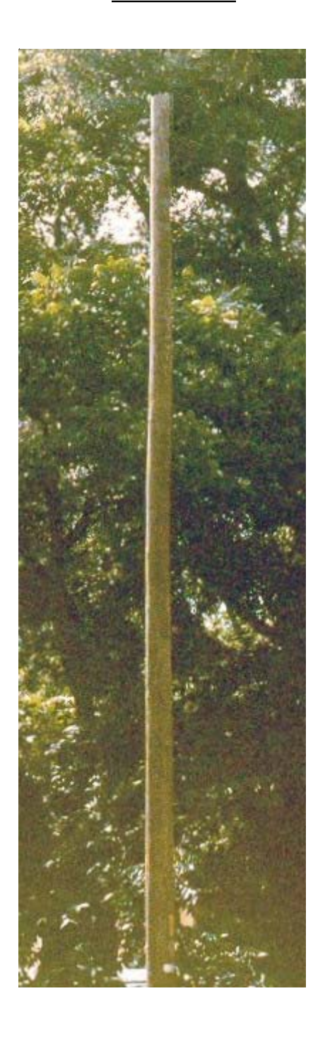
Poles P8, P12, P15, and P18