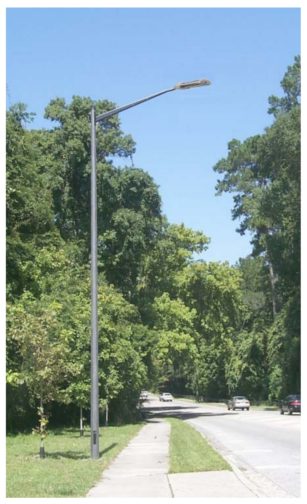
Light Types L42, L43 and L44